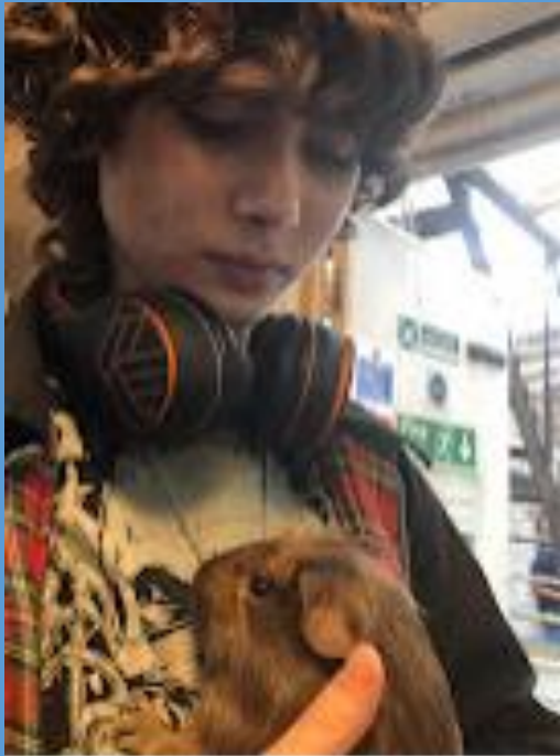
FALLING IN LOVE WITH HILARY!