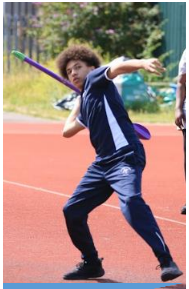
NEWHAVEN SPORTS DAY AT SUTCLIFF PARK

Not much makes us happier than when we hear from old students, so feel free to email Dom updates on occasion to be shared with the team.