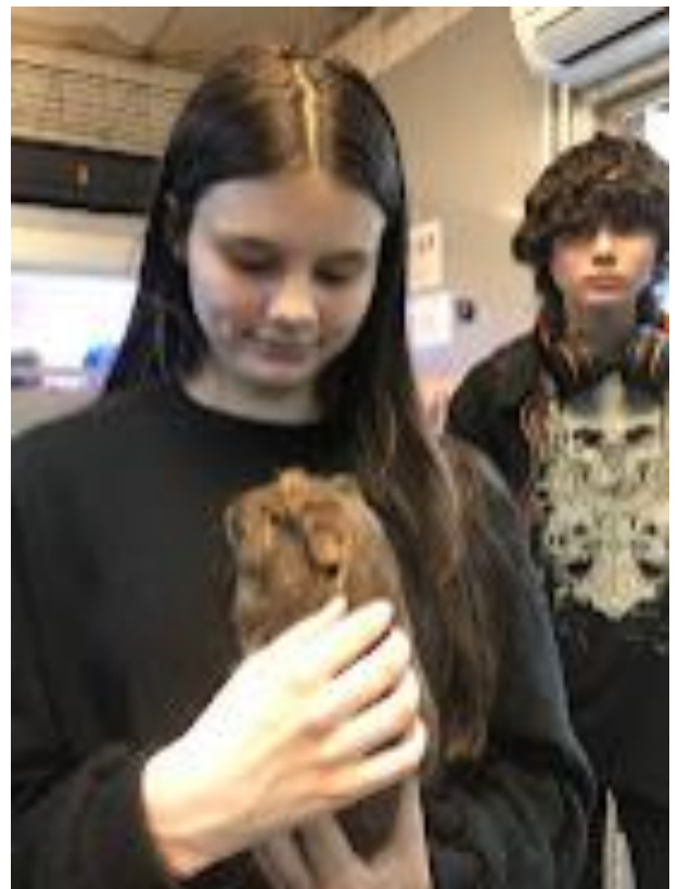
HOLDING GUINEAPIGS AT A LOCAL PET SHOP