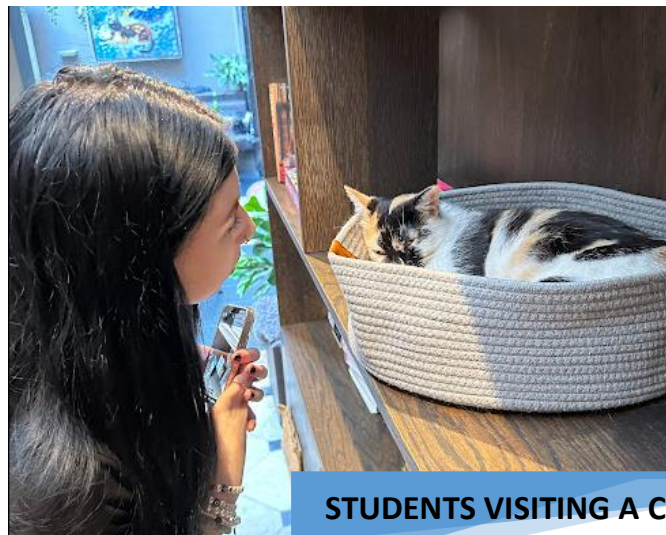
STUDENTS VISITING A CAT CAFÉ SUPPORTING RESCUE CATS